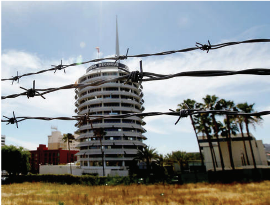
The the corner of Yucca and Vine Streets in Hollywood.

Thirty years ago, homeowners and neighborhood groups worried that high-rise towers along some of the city's major boulevards were destroying their low-rise communities and turning suburban Los Angeles into a gritty, traffic-clogged Manhattan. Sympathetic politicians heeded those worries and launched a ballot initiative, Proposition U, to stunt the growth of development in most of the city. The measure passed by a wide margin, fueled by anger at City Hall's failure to manage the boom or acknowledge residents' angst. It remains a significant constraint on developers' ability to build enough housing to meet the population's increasing demand.